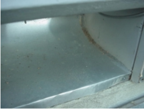
Figure 6.2 Contamination in passive system: dust collection on the air inlet