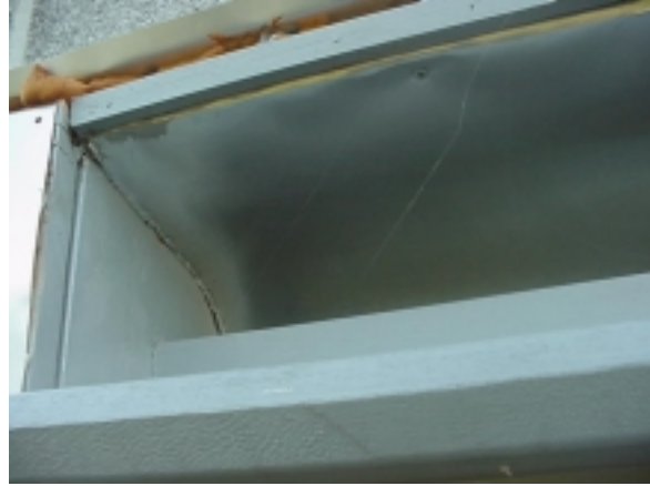
Figure 6.3 Contamination in passive system: spider net at the air outlet